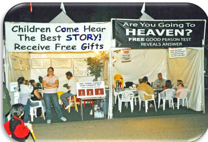
Southern California Fair at Lake Perris where eight people hear the gospel message at the same time.

We also have weekly church in the county prison in Banning, and do street ministry every Thursday and Saturday nights in Palm Springs, handing out hundreds of gospel booklets each night.