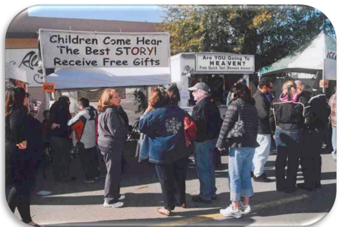
These are our two booths in the Tamale Festival. Note that three groups are hearing the gospel message at the same time.