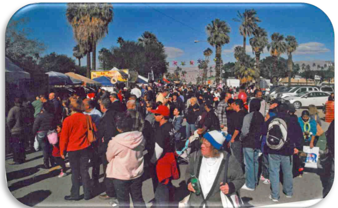
Huge crowds attend the Indio International Tamale Festival. We shared the gospel with 348 people and 141 of these prayed to receive Christ!

We spend tens of thousands of dollars on these outreaches. We depend on your partnership to help us pay our many bills for printing, postage, space rent, gasoline, diesel, signs, etc. Thank you so much for being our partner in this soul-winning ministry! We love and appreciate you! Keep praying. The devil doesn't like what we are doing!