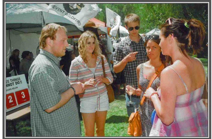
We even share the gospel in the midway outside our tent. (Note people holding wine glasses.)